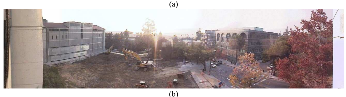
Fig. 4. Panoramas from two testing sites.