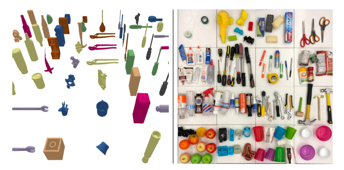
Fig. 3: Simulation object models on ( left ) and physical objects on ( right ) for decluttering.

We train the deep object recognition model on simulated data and adapt the learned model on real data such that the feature representations of the model are invariant across the