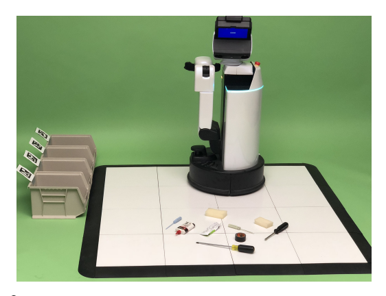
Fig. 2: Experimental setup for decluttering objects into bins with HSR.

boxes of the objects from the RGB image, while the grasp planning model predicts the optimal grasp action from the depth image. We compare the grasp planning approach with a baseline that grasps orthogonal to the centroid of the principal axis of the isolated segmented objects, and uses the depth image to find the height of the object centroid. We are interested in offloading the training and deployment of these models by simulation to reality transfer with Fog Robotics. The deep models are trained with synthetic images in the Cloud, adapted at the Edge with real images of physical objects and then deployed for inference serving to the mobile robot over a wireless network.